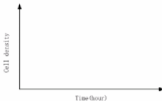
Figure example 1 Algal growth curve

Attach 1) a growth curve (Figure example 1) and 2) a figure showing the growth inhibition rates at individual test concentrations (Figure example 2) during the exposure period.